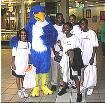
Local students meet the Hillsborough Community College mascot