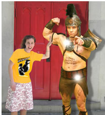
"Tough" t-shirt and life-sized cut-out